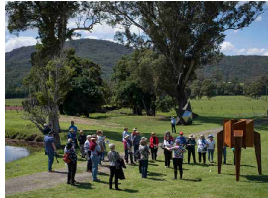
Visitors to Sculpture on the Farm

The initial inspiration for Sculpture on the Farm came from two directions: the desire to be involved in a community-based project in Dungog and the need to immerse myself in the creative realm. Hence Sculpture on the Farm came into being.