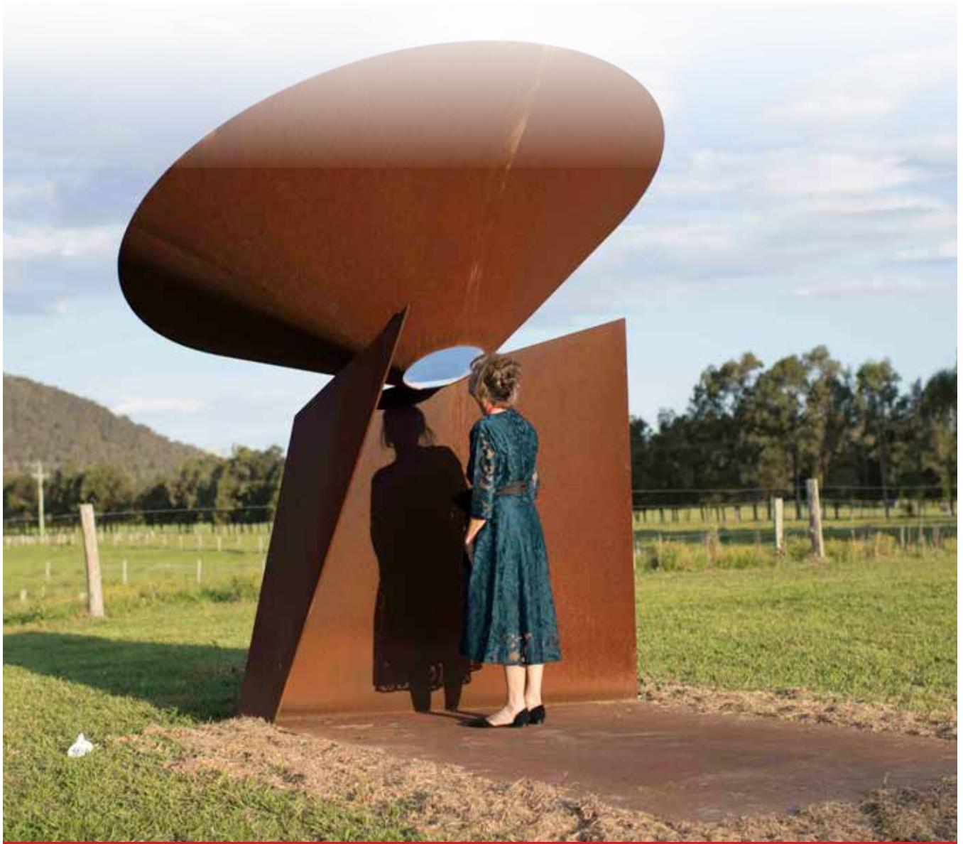
'Nothin' but Sky' by Braddon Snape, Photograph by David Oliver