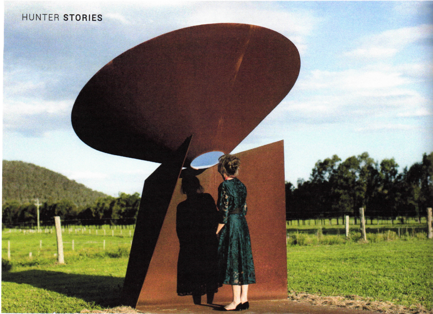
"Nothin' but Sky" by Braddon Snape